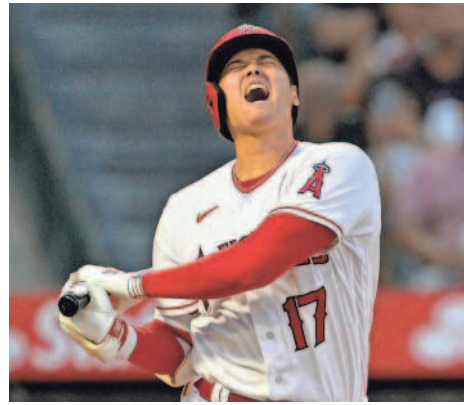
The Angels, with Shohei Ohtani, lost their first six games of August.

• Their majors-leading 212 home runs are 34 more than No. 2 Dodgers.